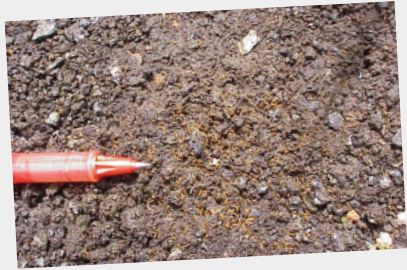
Colony of Little Fire Ants

Use a little peanut butter on a chopstick and leave them in several areas for about one hour. Any ants collected should be put in a sealable plastic bag, placed in the freezer for 24 hours and dropped off or mailed to any HDOA office. An informational flyer may be downloaded at: http://hdoa.hawaii.gov/pi/files/2014/05/LFASurvey.pdf