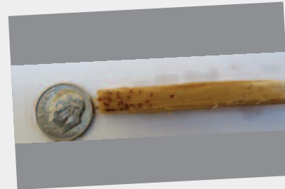
Little Fire Ants on Chopsticks

FOR MORE INFORMATION, including management of LFA, visit the Hawaii Ant Lab website: www.littlefireants.com